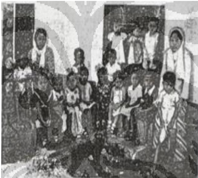
Gambar 2. Boestanoel-Athfaal Gorontalo Student

dengan kemoerahan dan pertolongan Toehan jang Maha Koeasa dan dengan kegiatan anggota-anggota pengemoedi perkoempoelan ini bekerja jang sehingga telah beroleh serba sedikit perabot soeatoe sekolahan, ialah bakal sekolahan Aisijjah. Maka pada hari Ahad tgl. 7 h.b. September j.b.l. telah dirajakan pemboekaan sekoalah Aisijjah terseboet... ..Seharoesnja hari pemboekaan sekolah terseboet ialah, Ahad 7 September 1930, akan dimasoekkan dalam babat tanah Gorontalo, ditoelis dengan mas. Sekolah terseboet diberi nama 'Boestanoel Atfal' jang hoebaja boebaja dengan perlindoengan dan pertolongan Toehan Jang Maha Moerah dan dengan sokongan saudara-saudara jang dermawan, akan berdirilah sekolah itoe sebagaimana mestinja dan pada akhirnya moga-moga tertjapailah jang diharapkan." (Aisa, 1930)