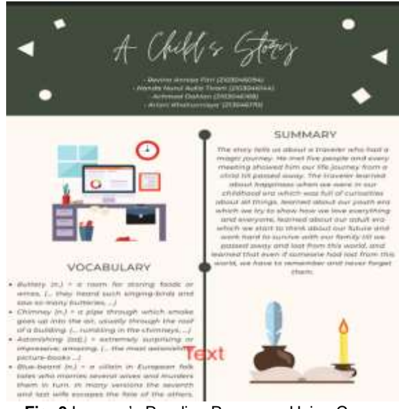
Fig. 3 Learner's Reading Response Using Canva

multimodal composing written via Canva. Fig. 3 shows an example of students' artifacts/ works derived from some DMC project tasks instructed to them. The example was taken from reading response task instructions.