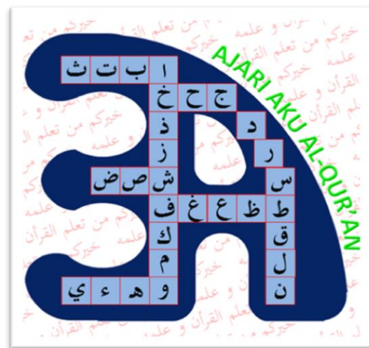
Figure 2: 3A Learning Media

3A was developed from the use of organic trash, such as some coffee packs, newspapers, and other trashes. The media is designed to make students learn the materials actively (student-centered), and can continue the materials independently and continually. The first step in 3A learning is saying Hijaiyyah letters in Bahdadiyah manner. After the students are able to recognize and say the letters well and correctly, the next step is to group and review the letters that are occasionally exchanged, such as the first group: ن ي, the second group ب ف ع غ م هـ, third group ج ح خ, fourth group ط ظ ص ض, and fifth group ر و ز د ن. Figures 2 and 3 illustrate the 3A puzzles.