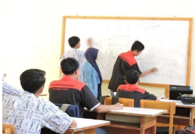
Figure 2. Application of Scaffolding model on the classroom.

Scaffolding learning outcomes learning model is superior to conventional learning models. Therefore, the implication to their motivation to learn by using scaffolding learning model is becoming superior to by conventional learning models.