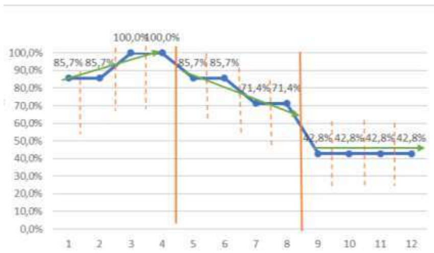
Graphic 1. Behavioural tendencies

Furthermore, to control the presence or absence of relationships between independent variables and dependent variables, observations were made again by releasing the intervention given. The behavior of the subjects was observed for one week before finally taking the data again, this phase is baseline-2 (A2). Table 1. Behavioural tendencies with baseline. The baseline-2 (A2) phase is carried out in four sessions. The results of observations in the baseline-1 (A1), intervention (B), and baseline-2 (A2) phases are raw data, meaning that the data has not been processed according to data analysis techniques and analysis. The data obtained is the condition of the subject's off-tasking behavior in each session. Then the data is processed using analysis under conditions and between conditions.