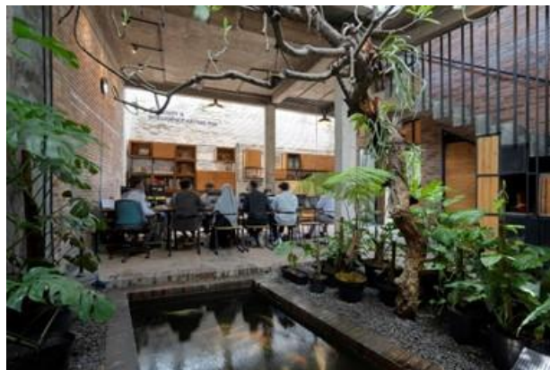
Image 3. Office CV. Andy Rahman Architect floor 1