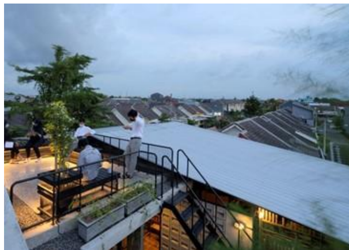
Image 5. Office CV. Andy Rahman Architect floor 3