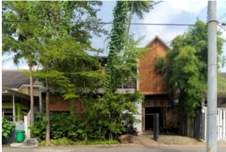
Image 1. CV. Andy Rahman Architect Office

The CV. Andyrahman Architect Office in S functions as a creative workspace embodying the architect's philosophy. Local materials such as exposed brick and natural wood serve as primary elements, with traditional Nusantara motifs abstracted into modern geometric façade patterns. The spatial arrangement supports cross-ventilation and ample natural lighting, affirming contextual responsiveness. This design highlights material honesty, maintenance efficiency, and a Nusantara visual identity in a modern expression (Nugroho & Sari, 2022; Wijoyo & Suryani, 2020).