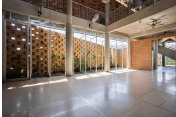
Image 6. Mosque Al-Fattah floor 1

(Source: Keajaiban Arsitektur Berkelanjutan Modern: Masjid Lego Sidoarjo | CHANGEMAKR.ASIA )