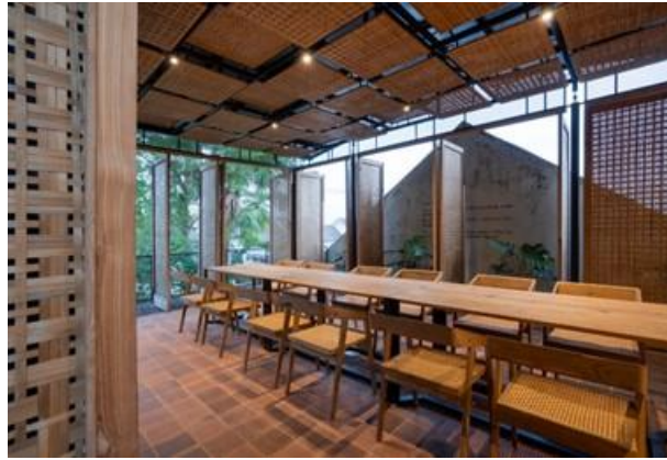
Image 4. Office CV. Andy Rahman Architect floor 2