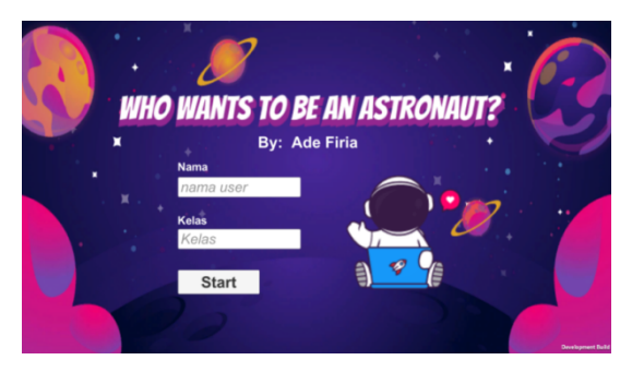
Figure 2. Appearance Early Media Gamification

media expert. The revised gamification-based learning media was then carried out feasibility trials on students (Figure 1 to 5).