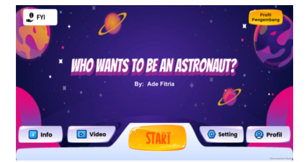
Figure 3. Home Menu Display