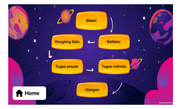
Figure 4. Appearance Contents Menu