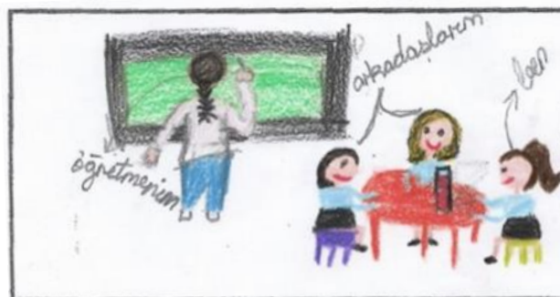
Figure 3 Sub-theme student drawing presenting the subject of the theme of teacher behavior (Private School)

& Arıcı, 2015). However, it has been revealed that only one student per school sees the teacher as the record holder. The literature does not support this result of the study. That may be that even if the teacher keeps records during the lesson, it is not reflected in the student's image.