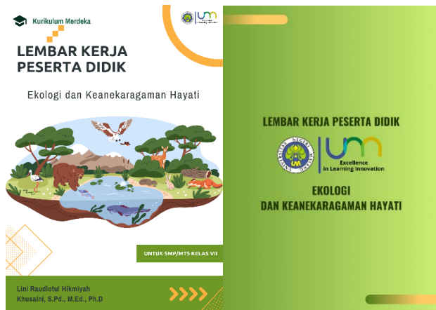
Figure 2 Design front and back cover of the LKPD