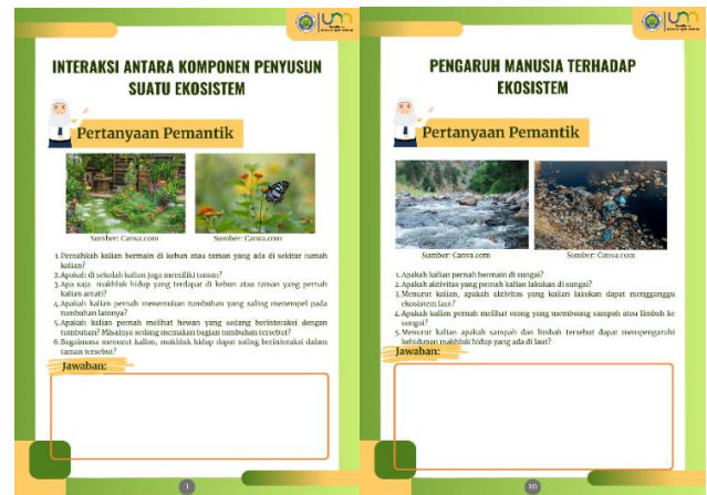
Figure 3 Trigger questions at the beginning of each sub-material

In addition to use triggering questions (Figure 3), the developed LKPD also applies the syntax of the Problem Based Learning model because it is considered to encourage a sense of interest, and requires students to actively participate in solving problems by finding answers to understand a concept of learning material, so as to build student motivation (Zaraturrahmi, Adlim, & Zulkarnaen, 2016). There are five PBL syntaxes applied in this LKPD, namely orienting students to the problem, organizing students to learn, guiding individual and group investigations, developing and presenting results, and analyzing and evaluating the problem-solving process. The developed LKPD is also equipped with articles and videos of problems related to concrete events experienced in life, so that students are expected to find solutions to the problems given and apply the solutions designed in life to preserve their environment. There are three problems included in the ecology and biodiversity LKPD, namely the problem of the exploding caterpillar population caused by