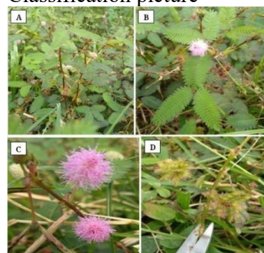
(Image of Morphological Characters of Mimosa pudica . A Stem , B= leaf , C= flower, D= fruit )