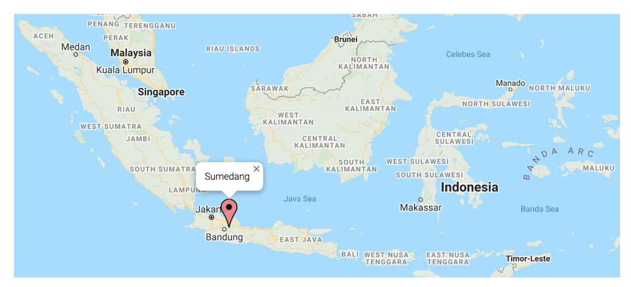
Figure 1. Research Location

This research was conducted in Sumedang Regency, West Java. West Java Province consists of 27 regencies with Sumedang as the center of the research location. This Regency is divided into three regions based on the level of progress, namely urban, transitional, and rural regions. The target participants were initially elementary school teachers in Sumedang. However, after being socialized through social media such as Whatsapp, Instagram, and Facebook, there were many positive responses from teachers outside Sumedang Regency. Therefore, it was decided that the participants were not only in Sumedang, but also from outside the regency. However, the research location was still centered in Sumedang where the researchers live and work. The research location is shown in Figure 1.