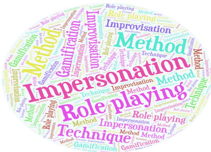
Figure 1. Concepts in Drama Definition

In this part, the codes of the categories determined by the finding of data analysis were provided along with the models. The researcher classified participant opinions into themes and code models. Moreover, the findings obtained from the participants were supported by direct quotations. It was observed that the participants frequently emphasized the concepts of animation, improvisation, gamification, role-playing, method, and technique. The concepts that the participants attributed to the drama while making sense of it are presented in Figure 1.