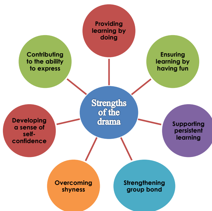
Figure 2. Codes Related to Strengths of Drama Theme

The teachers who participated in the study emphasized the method's strengths rather than its flaws, claiming that it would not have any disadvantages if used by experts. The participants expressed a common thought that the drama method rescued the subject from boredom and made learning fun and permanent. The opinions of the participants on this subject are as follows: