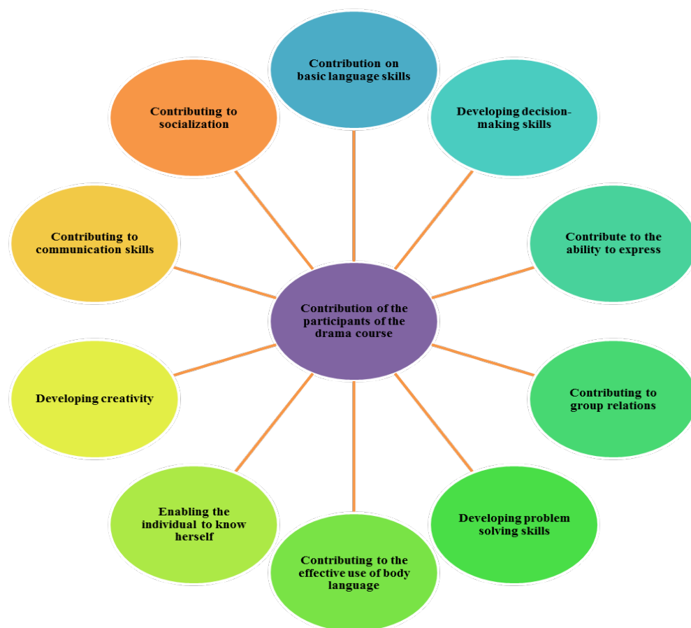
Figure 4. Themes and Codes Related to the Contribution of the Drama Course to the Participants

Themes and codes about the contributions of drama to the participants after the drama course are presented as a model in Figure 4.