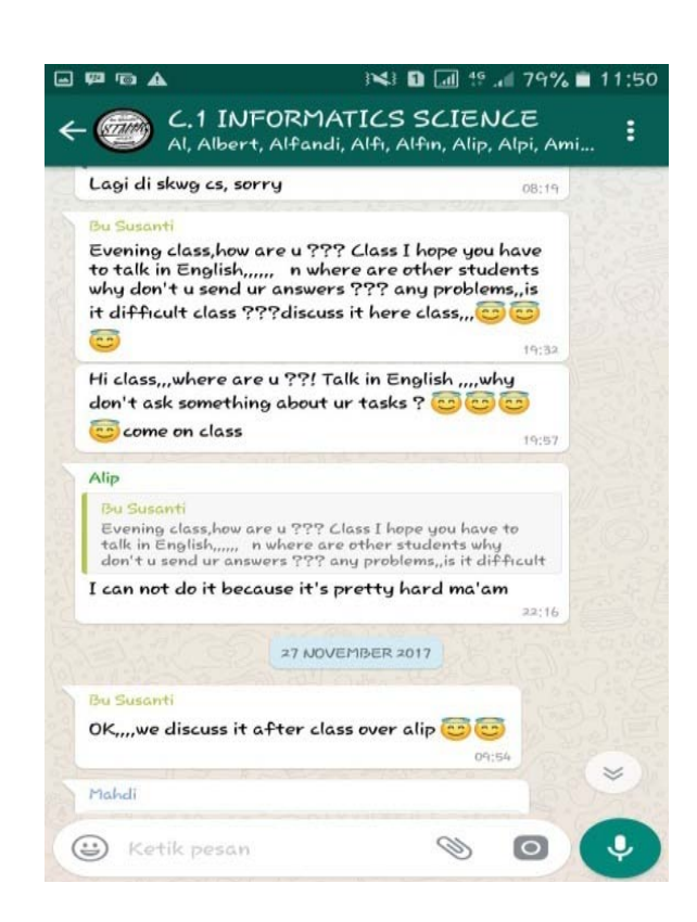
Figure 2: WhatsApp Platform

Next, 24% of the students disagree with WhatsApp applied as the assisted learning tool in teaching and learning English. Of course, there are some reasons followed, such as: "They didn't understand what the passage was, but shamed to ask to their friends or their lecturer"; "They were passive students, lazy, afraid to make mistakes"; and even "They are not ready with the technological advanced applied in education, such as the use of