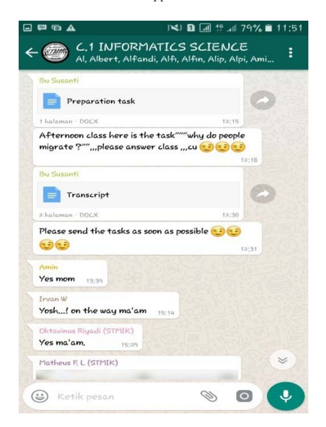
Figure 3: WhatsApp Platform