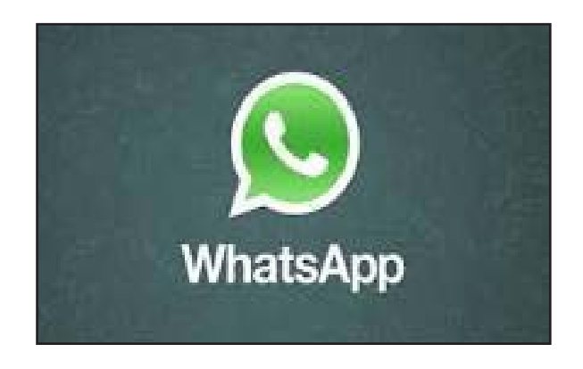
Figure 1: WhatsApp Icon

and knowledge be provided and elaborated in some websites, such as at web.2.0, website of <a href="http://learnenglishbritishcouncil.org/en/apps">http://learnenglishbritishcouncil.org/en/apps</a> (10/7/2019), and some others interesting and insightful webs, which will be helpful for beginners and other levels learners to learn English at anytime and anywhere, formal and informal situation (Motteram, 2013; Pim, 2013; and Akhmad & Amiri, 2018). All the vary and essential information preceding can be accessed through WhatsApp mobile learning as the right forum for discussing and sharing for learners and teachers. See figure 1.