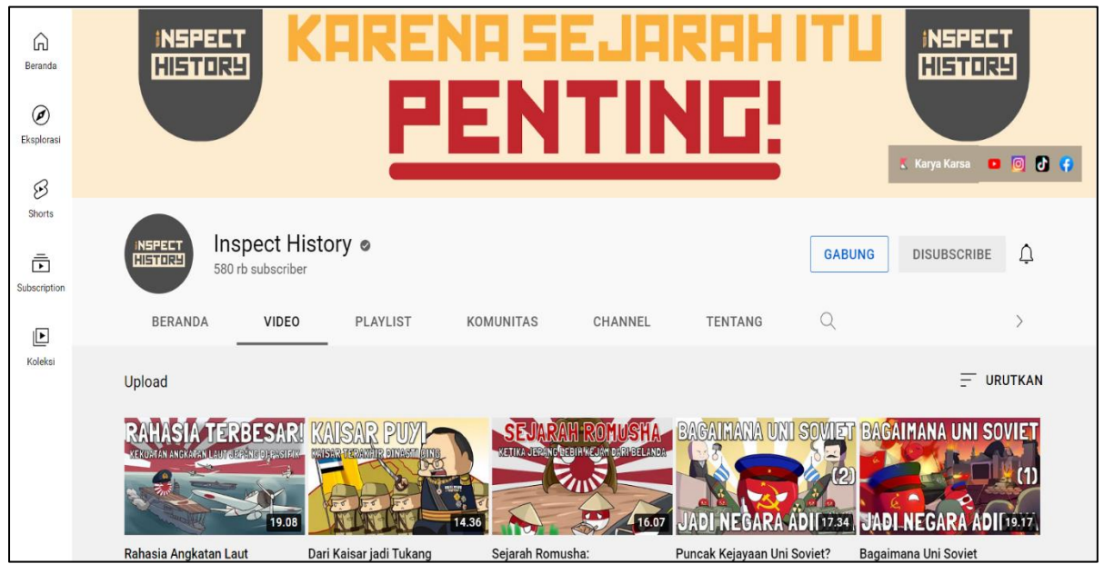
Figure 1. Inspect History's YouTube Account

The choice of name Inspect History itself was used as the name for the Youtube account because of the meaning of the word. The word Inspect means to dig or dig in-depth, and the word History means History or past events. Thus, along the way, we will find exciting things related to other History, and of course, they will undoubtedly influence our lives today.