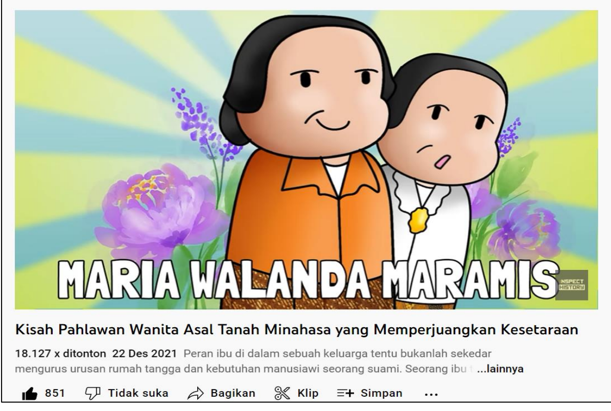
Figure 3. Inspect History Animation Video Footage

Moreover, it also discusses the factors that led to success or glory during the Majapahit Kingdom. Of course, this gives an understanding that the Indonesian nation, especially the Archipelago, at that time had given birth to many significant figures, and their prowess could be compared with other significant world figures. This is also a way to re-instill our sense of pride as part of the Indonesian nation. Furthermore, an animated video that discusses the Story of a Female Hero from the Land of Minahasa who Fights for Equality was uploaded to coincide with the commemoration of Mother's Day. The video has been watched 18 thousand times and received 851 likes and 99 comments.