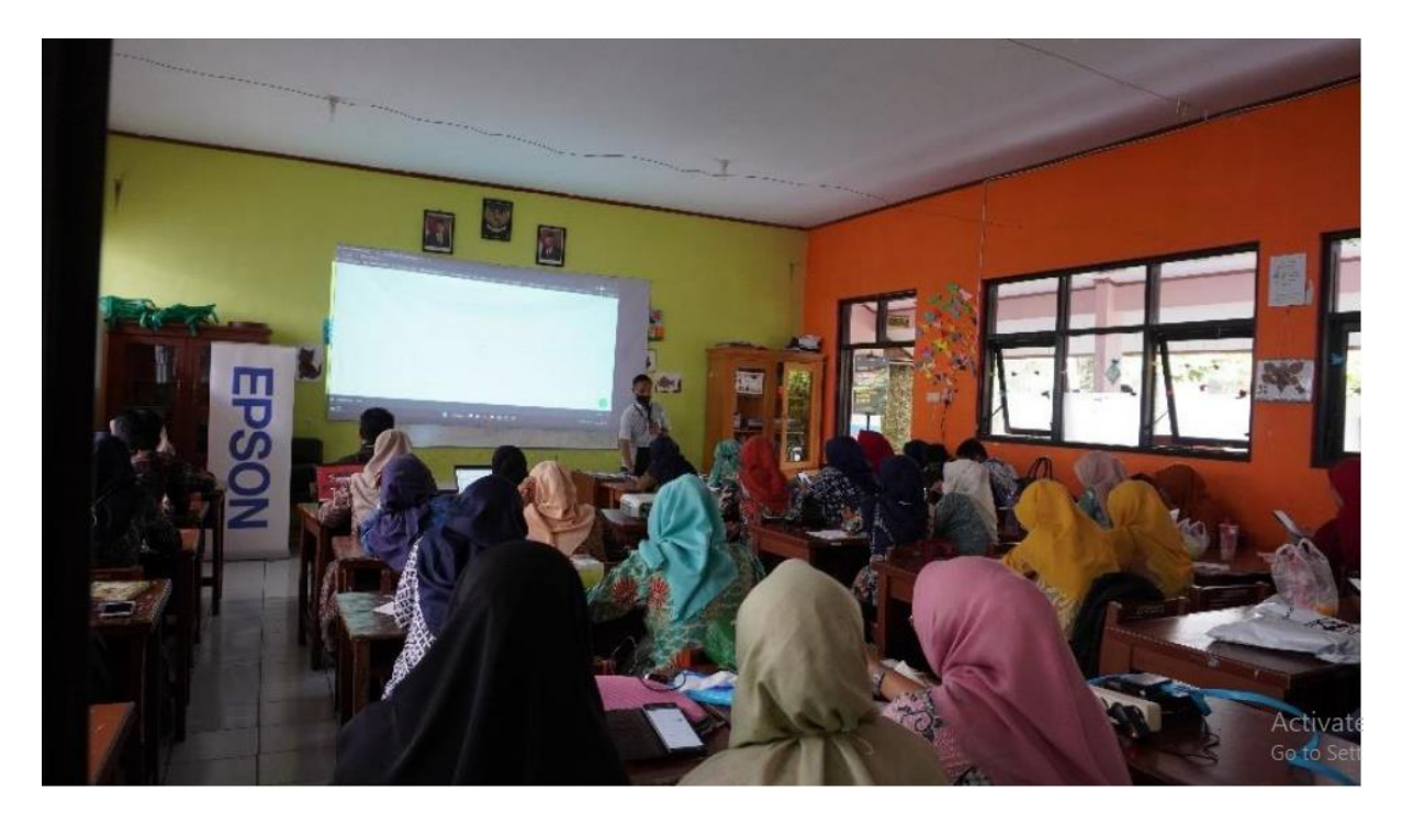
Figure 1. Materialization of LMS Karya Anak Bangsa

Based on the activities, the participants who participated in this training activity consisted of 200 elementary school teachers throughout Tasikmalaya Regency. Previously, 61% of the participants had never participated in training activities, another 38% had attended, and another 1% often participated in similar activities related to the hybrid learning training model using this Learning Management System (LMS). During the training and mentoring activities, the Learning Management System (LMS) operated was LMS Edunex. The evaluation of education and training activities found that as many as 100% of the participants had participated in education and training activities from start to finish, with 92% of participants having completed assignments in the Edunex Learning Management System (LMS) used in this training activity.