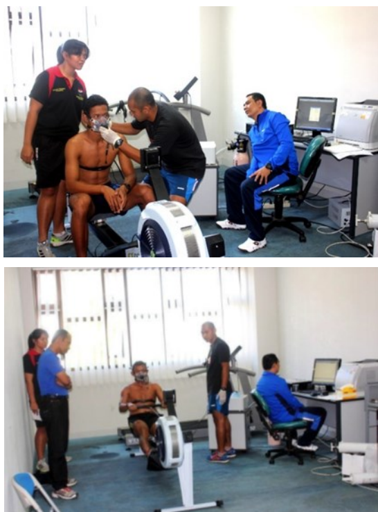
Figure 1. VO2max Test with COSMED on Rowing Machine

ter with a drag factor of 115 for women and 130 for men for 5 minutes. The drag factor was increased gradually (20 drag factor in every minute) until the athlete was unable to row.