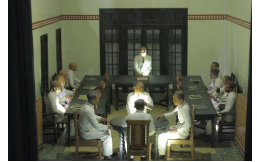
with the diorama of Asian-African Conference. Picture 5. The Diorama of Linggarjati Negotiations

warrior figures or from the past events for social studies subject in junior high school. The researcher found values contained in the museum. For instance, it can be seen from the diorama of Sakola Kautamaan Istri, there can be found the value of struggling, the value of good model, and the value of caring that was shown by R. Dewi Sartika. The relief of Indonesia Menggoegat which Soekarno speech to defend from colonialism. The value shown by the relief is the value of braveness to struggle or put the unending effort for the nation. The diorama of Palagan Bojong Kokosan is an heroic action from the warriors in West Java to catch the enemy. Here, the value that students can gain are the value of struggling and braveness. So does