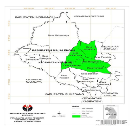
Map of Sukamulya Village

Sukamulya Village is a part of Kertajati Sub-District, Majalengka District area. Geographically the location Sukamulya Village area is located in the north Majalengka District and south Kertajati Sub-District. Sukamulya Village is located in an altitude of 565m above sea level with maximum average air temperature 27° Celcius.