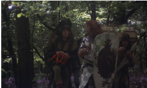
Figure 10 Sir Robin feeling uneasy after hearing a song from his minstrel

Evaluation context is made from incongruity and superiority triggers that come through indirect communication to form an irony, an expression when someone says something that has contradictory meaning to what they say, which causes the audience to reevaluate its meaning. In the film, Monty Python uses evaluation context in four sequences, which is the least of all types of contexts.