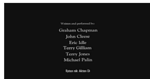
Figure 1 Opening credit with Swedish Subtitle

(De-) normalization Contexts arises when both superiority and incongruity triggers appear in the text that causes a cognitive violation, also known as an unexpected moment that caught people off guard . The moment refers to a situation where an event is expected to happen but in reality, something else happens, or in some cases, the event does not occur at all. In this film, (De-) normalization contexts appear the most frequently with 15 sequences from a total of 21 sequences. An example is given in Sequence 1, the opening sequence. In this sequence, the opening credits show the people who are involved in the creation of this film. Besides a list of names, this credit also showed a Swedish subtitle