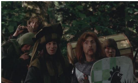
Figure 11 Sir Robin visibly scared while his minstrel sang a song about him

was finished as he can't take it anymore.