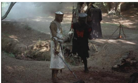
Figure 4 Despite losing 3/4 of his limbs, The Black Knight insist to fight King Arthur

Meanwhile, linguistic and pragmatic incongruity triggers appear when the audience realized that the Swedish subtitle is mainly "Swedish accented" English (Fig.2) and the fact that the subtitler breaks a maxim of conversation, which is to be relevant .