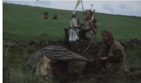
Figure 6 Dennis Blatantly disregard the established lore of King Arthur tale and mocking it

target of ridicule by a peasant who believes in a more relatable, modern system. The act of disregarding the lore of a story is highly incongruous and rarely seen, especially at the time this film premiered.