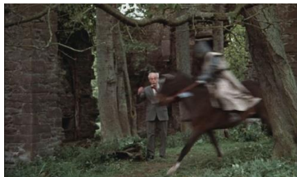
Figure 7 the famous historian murdered by a knight with a real horse

Context of solution is composed of incongruity and superiority triggers that require further knowledge to be obtained before the humor appears, otherwise, the humor will be missed. Fortunately, in this film, most of the further knowledge is given as the film plays. In total, there are seven contexts of solution, four of which are connected to the end sequence of this film.