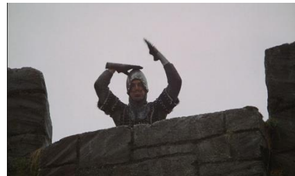
Figure 5 The french rudeness is exaggerated in this film to the point that it looks silly

Although the Frenchman spoke with a silly accent all the time, the words such as "outrageous" and "nice-a" are so heavily accented that it sounds ridiculous.