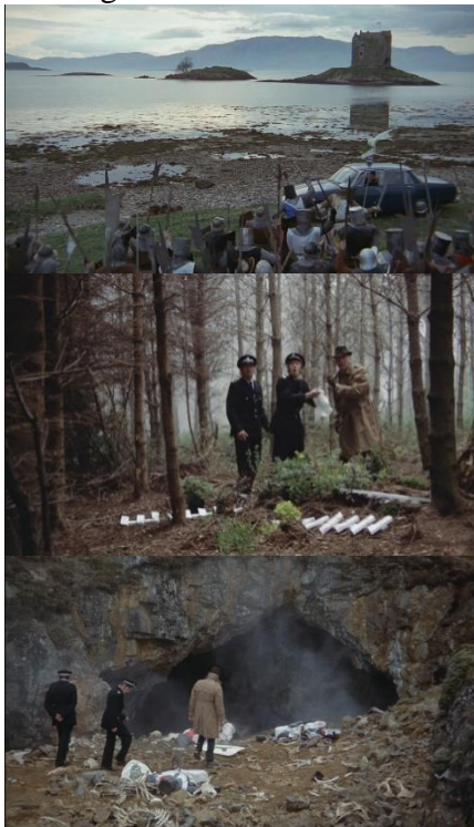
Figure 8 Police investigating the last known locations of King Arthur

historian's death at the end of several sequences, namely Sequence 15, Sequence 17, and Sequence 19. In Sequence 17, as shown in figure 8, the police are seen in the same scene where King Arthur and his knight have been previously seen, which is shown through the use of the mise-en-scene element, setting. The use of setting is indicated by the broken picket fence from where the shrubbery used to be in Sequence 15. This additional information is important as it tells the audience that the police are onto King Arthur and his knight.