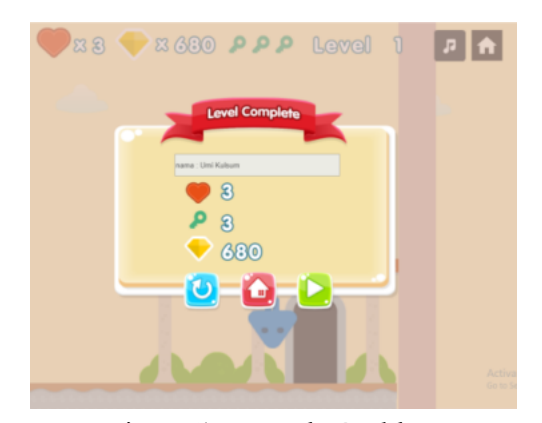
Figure 5 Example Problem

After getting the green key, players will answer practice questions based on the material. There are 3 keys in each game, questions will appear randomly. If the answer is wrong, another question will be displayed, if it is correct the player will continue the game until the end of level 1. After the level 1 game is finished, a score acquisition display popup will appear, which can be seen in the following