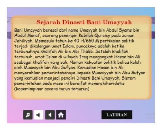
Figure 3 Example of Material

Game instructions contain instructions that must be passed by the player. Starting from the keyboard arrow keys to move the player, yellow gems to get points, keygreens to get questions as keys to enter the next level, as well as enemies that must be killed or passed. Players are given 3 lives in the form of love which means they can survive in the game if their lives don't run out. After that, return to the main page and click the start button to continue the game, then players are asked to fill in their names in the available fields. Next is an example of display material.