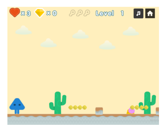
Figure 4 Game Display

The results of the design development of the game and level 1 questions can be seen in the following