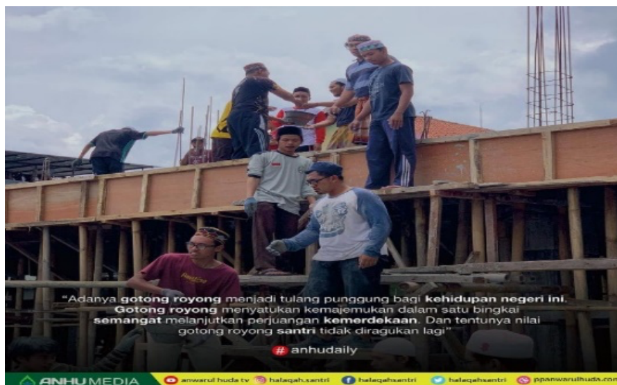
Figure 2. Roan activity (community service) building a Pondok

The roan punishment is not meant to degrade the santri's personality, but to raise the level of humanity in order to understand the nature of the function of humans created in this world. Loose thinking and obedience to boarding school rules make it easier for students to adapt when facing a new world after graduating from Islamic boarding school. This can be called middle way thinking, the moderate behavior of santri conveys the nature of mutual cooperation and harmony between santri. The form of roan activity can be in the form of cleaning, there is also roan in the form of jointly building buildings, as well as preparing places of worship and other public facilities in the Islamic boarding school environment.