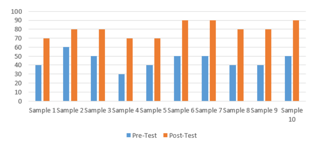
Figure 1. Pre-test and post-test results

Learning activities at the State Elementary School 2 Kasomalang are carried out online. The learning media used are through whatsapp group, and google meet. We conducted research using a questionnaire in the form of a gform. This form is disseminated to elementary school students via whatsapp group to find out how far the knowledge of volcanic disaster mitigation is to elementary school students, this research is to find out how much knowledge elementary school students have about disaster mitigation when the post test and pretest are carried out. When the post test has been completed, we conducts a literacy movement regarding the importance of mitigating the Merapi eruption disaster. Figure 1 describes the results of the pre-test and post-test which are depicted using graphs. Table 2 describes an increase in each student during the pre-test and post-test.